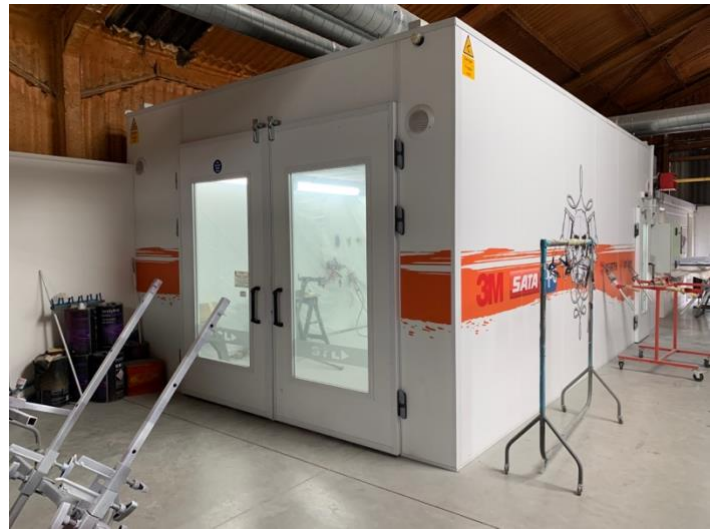
Spray booths available by separate negotiation